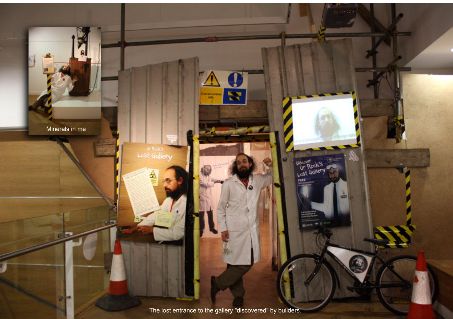
The lost entrance to the gallery "discovered" by builders.