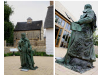
Sculpture from the rear shows the icons that inspired Clare, all dramatised on the audio tour.

Client contact Lynn Jackson Clare Cottage Woodgate Helpston Peterborough PE6 7ED